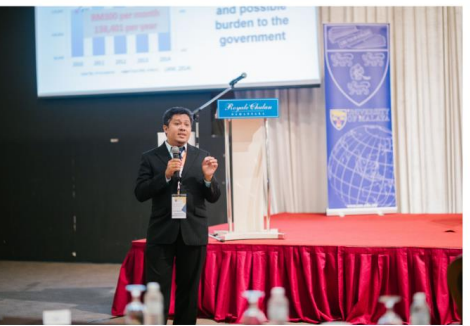
MPP students delivering policy paper presentations at the International Conference on Emerging Issues in Public Policy organized by INPUMA (August 2019)